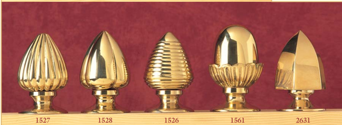
MIDDLE SHELF From left to right: Full details on page B12 1527 Fluted Peardrop 1528 Segmented Peardrop 1526 Ribbed Peardrop 1561 Plain Acorn 2631 Hexagonal