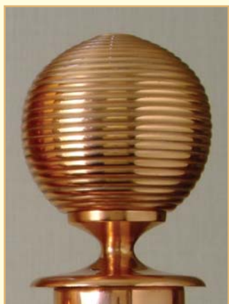
SATIN OR POLISHED COPPER