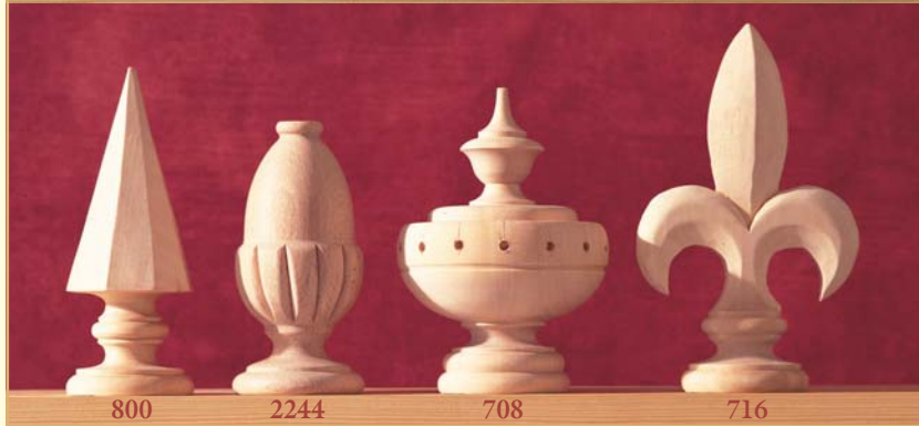
BOTTOM SHELF From left to right: Full details on page B3 800 Carved Arrow Head 2244 Fluted Acorn 708 Spinning Top 716 Carved Fleur de Lys

Looking for Finials with a more modern and contemporary style?? – see the “VISION” range full details on page E12