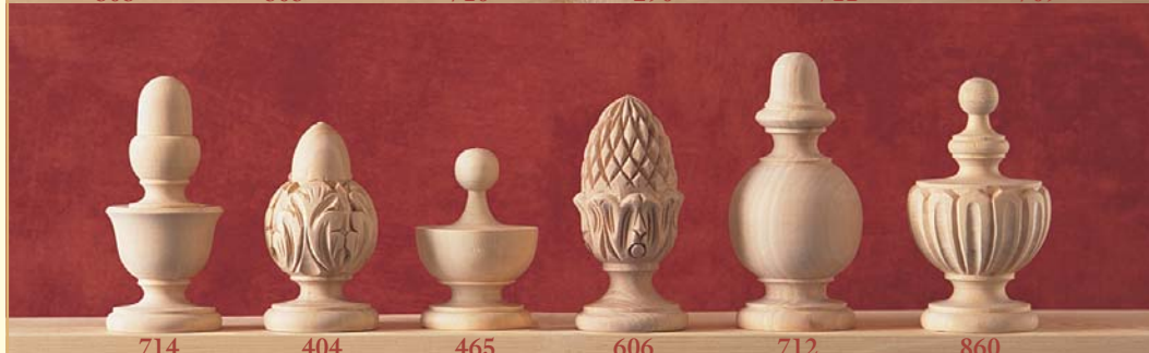
BOTTOM SHELF From left to right: Full details on page B6 714 Acorn Urn 404 Carved Acorn 465 Vase 606 Carved Pineapple 712 Carousel 860 Carved Minaret