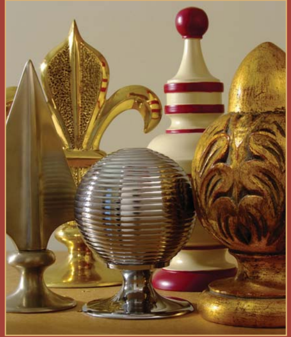
Wood and Brass Finials