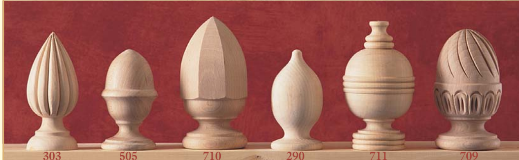
MIDDLE SHELF From left to right: Full details on page B5 303 Fluted Cone 505 Plain Acorn 710 Saxon 290 Lemon 711 Lantern 709 Carved Tudor