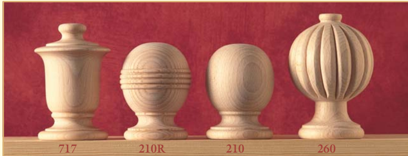
TOP SHELF From left to right: Full details on page B3 717 Urn 210R Ribbed Ball 210 Plain Ball 260 Fluted Ball