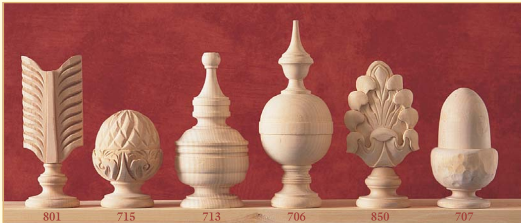
TOP SHELF From left to right: Full details on page B4 801 Carved Tail Feathers 715 Carved Pomegranate 713 Jester 706 Arabic 850 Carved Roman 707 Dimpled Acorn