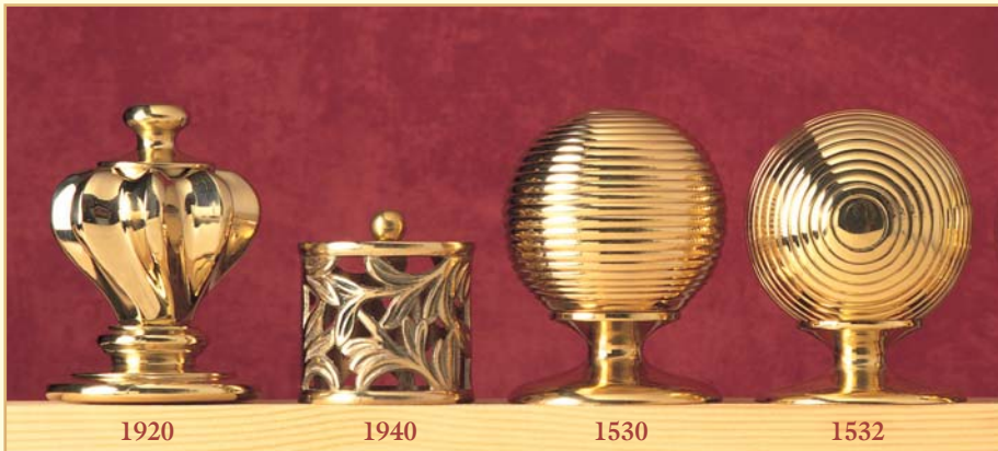
TOP SHELF From left to right: Full details on page B11 1920 Coronet 1940 Filigree End Cap 1530 Ribbed Ball 1532 Reeded Ball

Looking for Finials with a more modern and contemporary style?? – see the “VISION” range full details on page E11