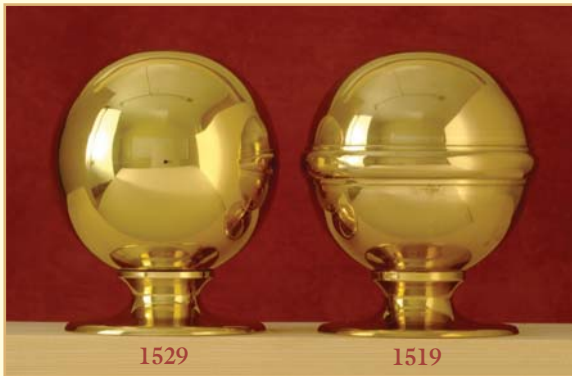
From left to right: 1529 Plain Ball 1519 Ball End with decorative rib