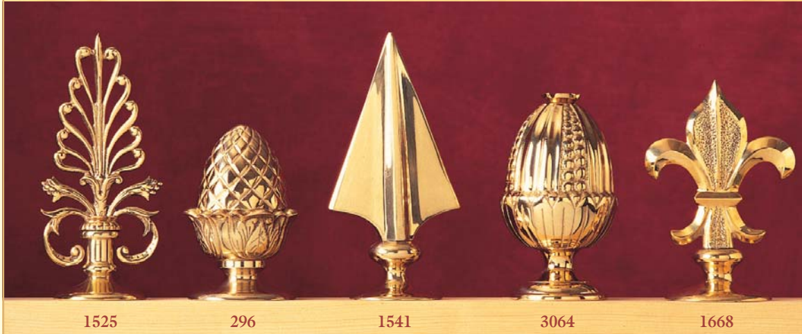
BOTTOM SHELF From left to right: Full details on page B12 1525 Honeysuckle 296 Pineapple 1541 Spear 3064 Decorative Acorn 1668 Fleur de Lys