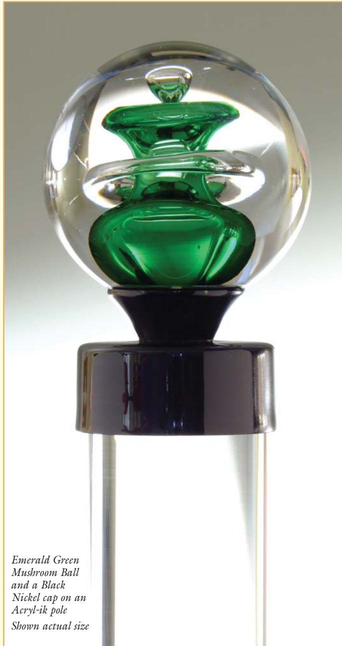
Emerald Green Mushroom Ball and a Black Nickel cap on an Acryl-ik pole Shown actual size