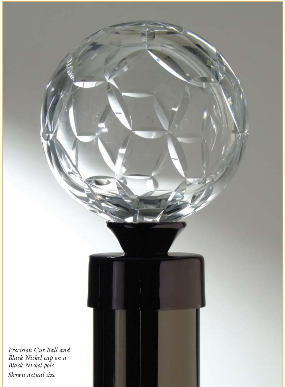
Precision Cut Ball and Black Nickel cap on a Black Nickel pole Shown actual size