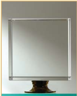
PRECISION CUT CUBE