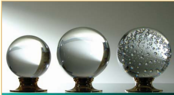
SMALL CRYSTAL BALL