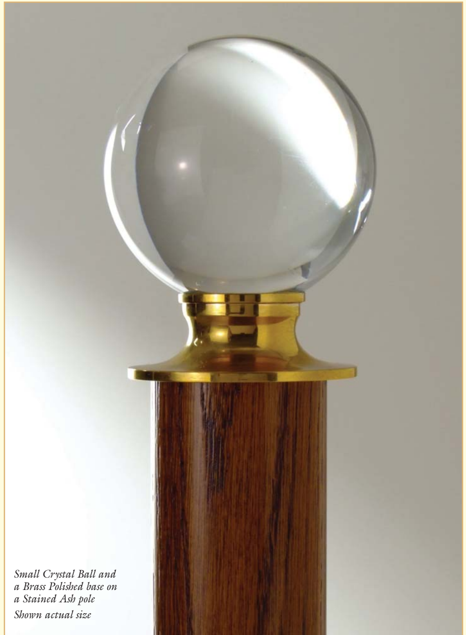
Small Crystal Ball and a Brass Polished base on a Stained Ash pole Shown actual size