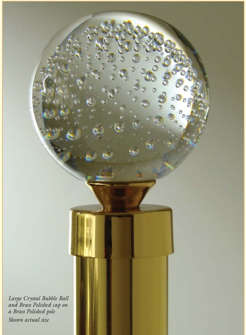
Large Crystal Bubble Ball and Brass Polished cap on a Brass Polished pole Shown actual size