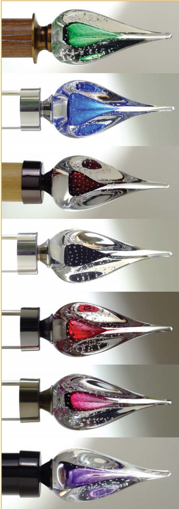
3 SIDED ARROW