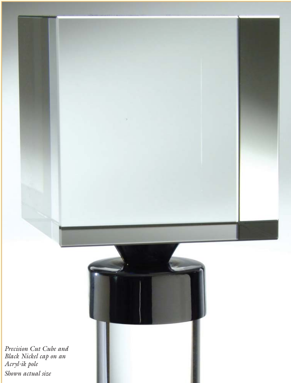
Precision Cut Cube and Black Nickel cap on an Acryl-ik pole Shown actual size