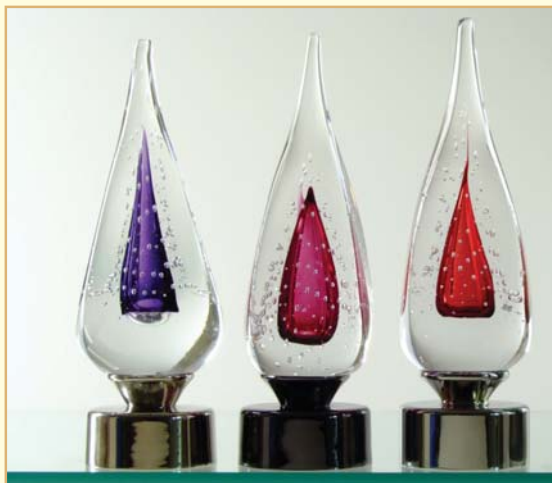
AMETHYST VIOLET RED ROSE