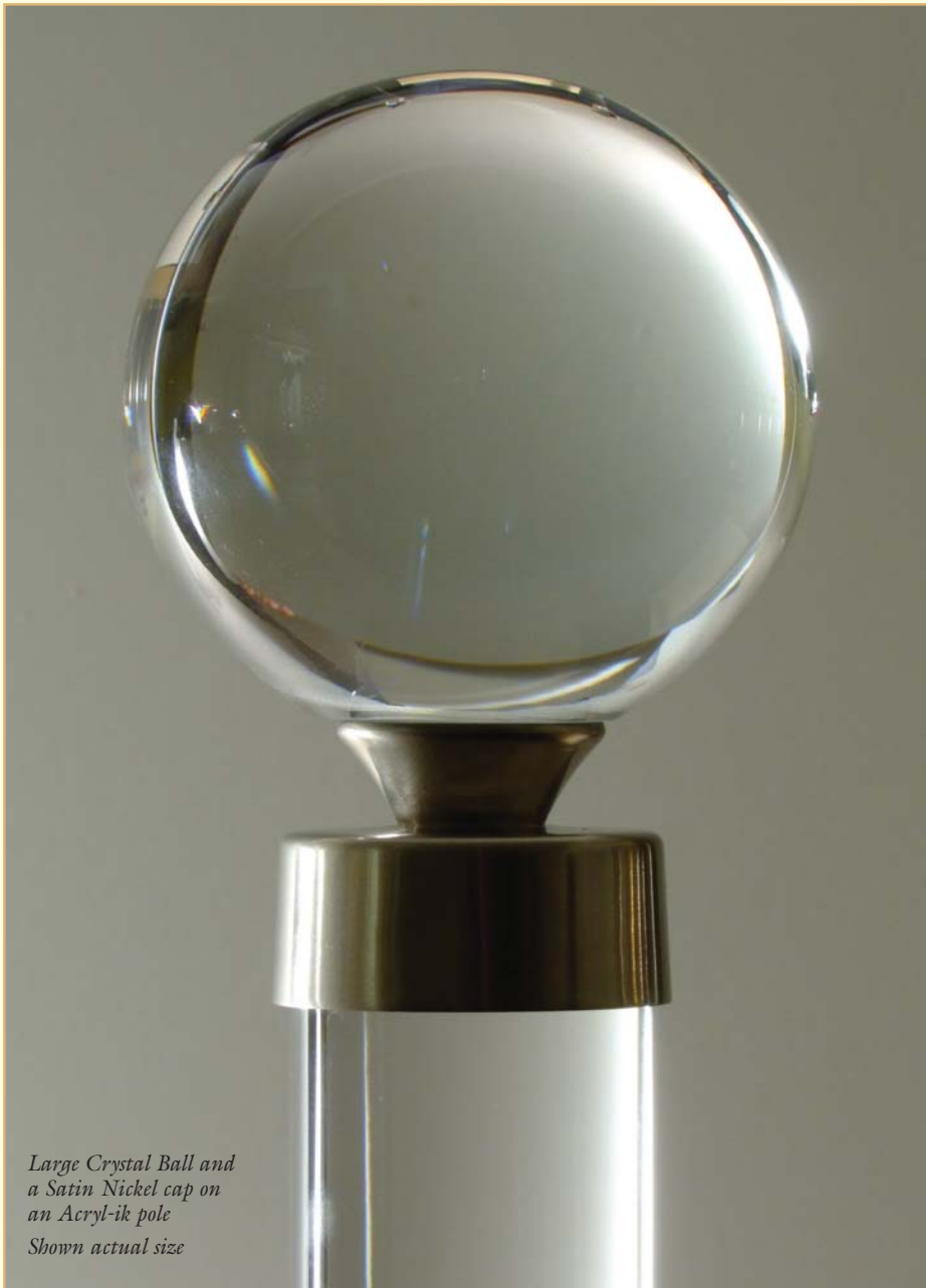
Large Crystal Ball and a Satin Nickel cap on an Acryl-ik pole Shown actual size