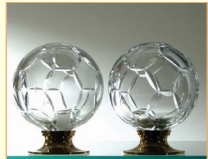
FROSTED CUT BALL