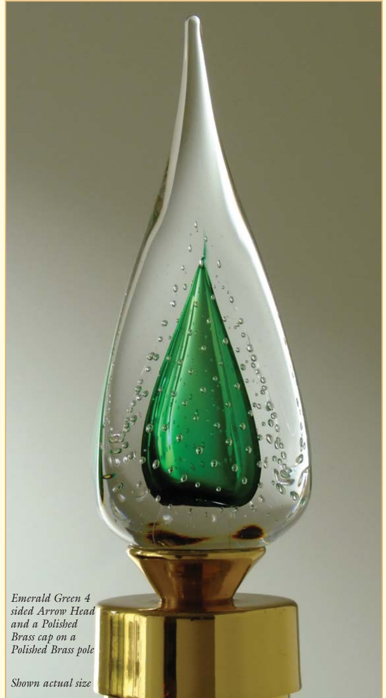
Emerald Green 4 sided Arrow Head and a Polished Brass cap on a Polished Brass pole