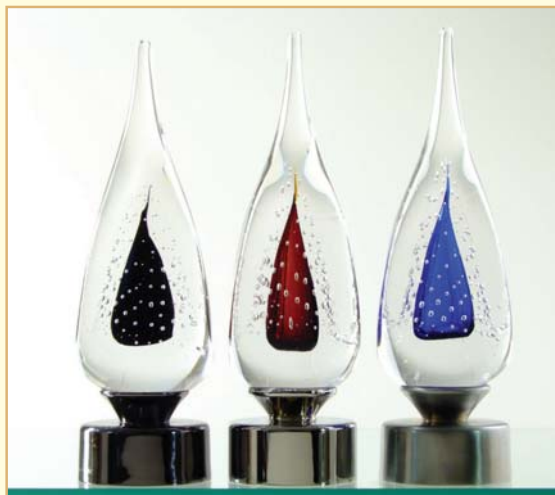
VELVET BLACK ONYX COBALT BLUE