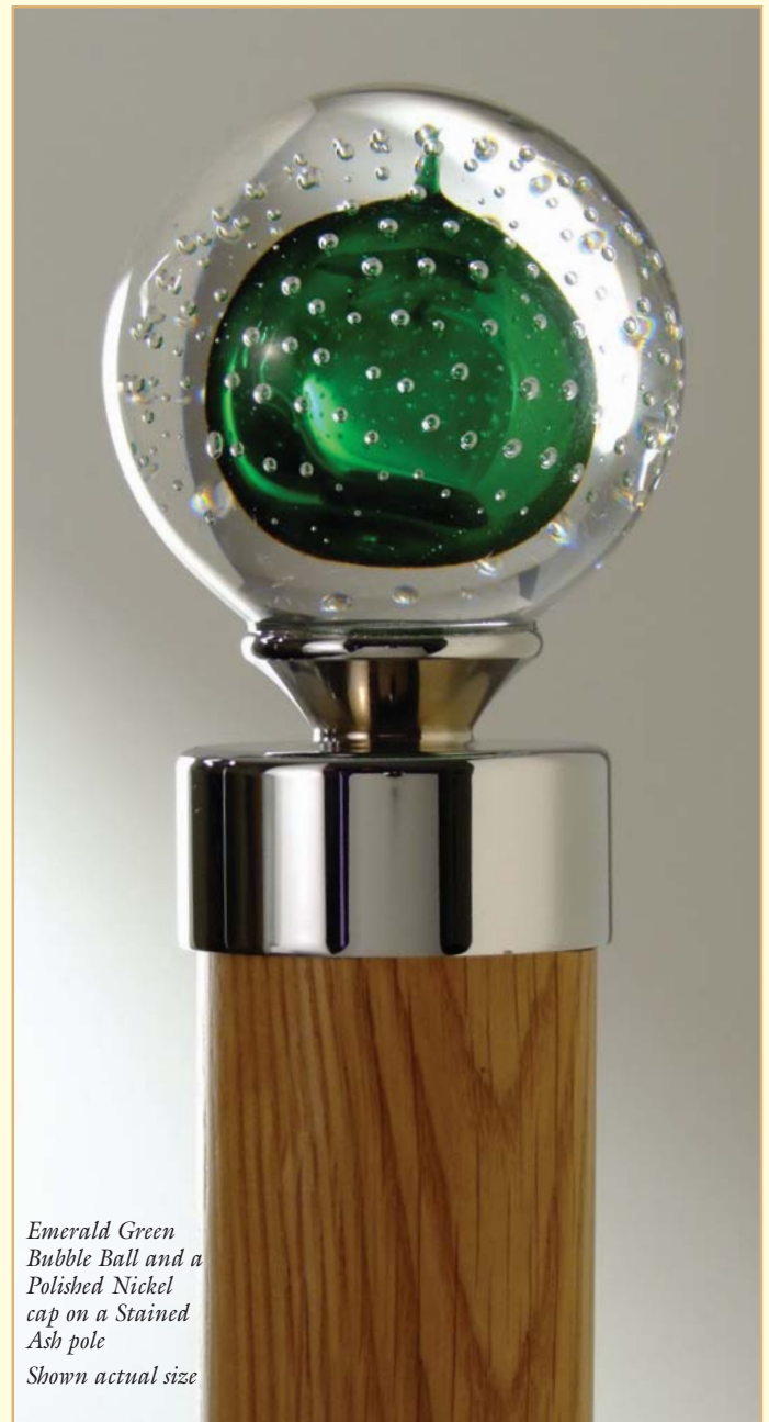
Emerald Green Bubble Ball and a Polished Nickel cap on a Stained Ash pole Shown actual size