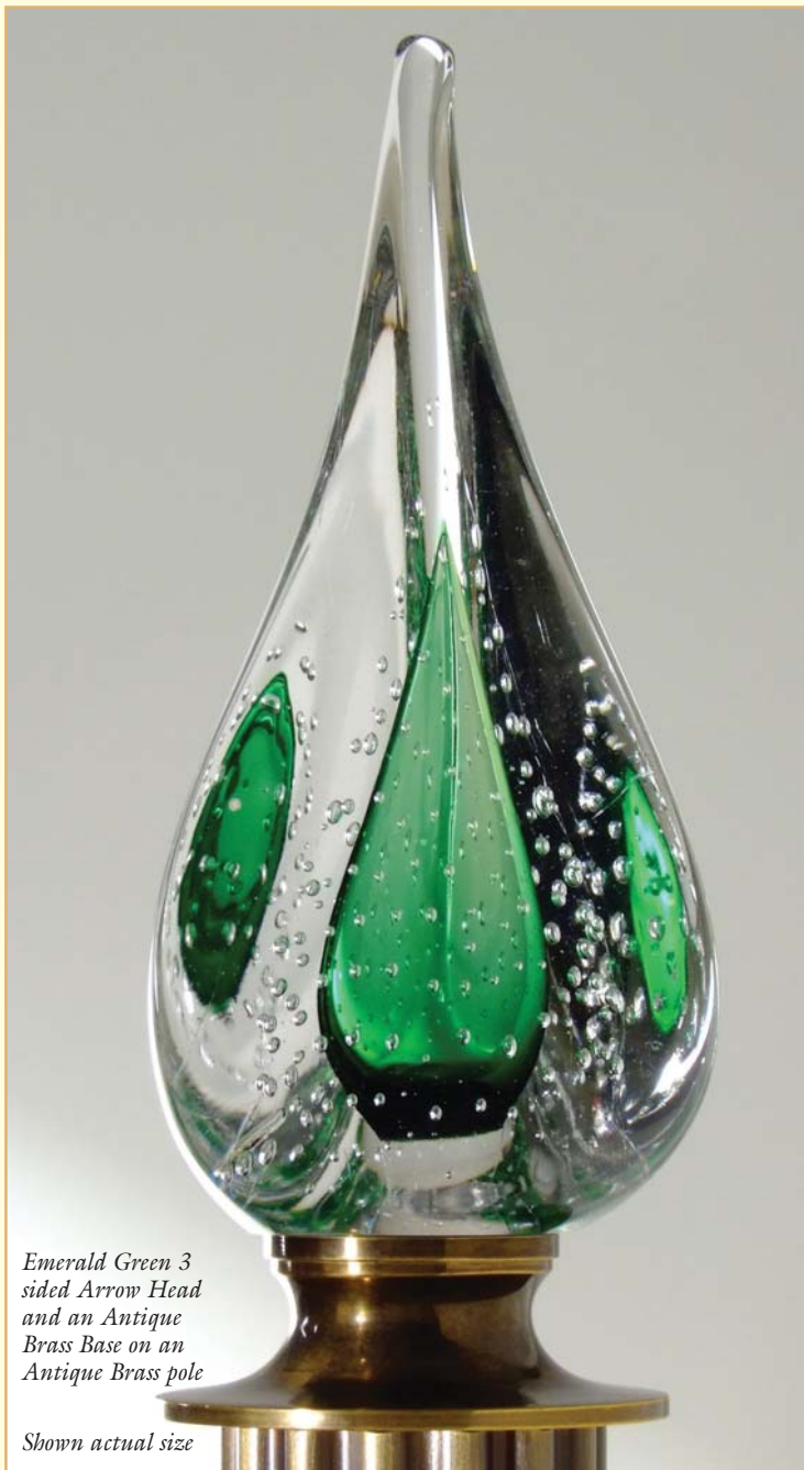
Emerald Green 3 sided Arrow Head and an Antique Brass Base on an Antique Brass pole