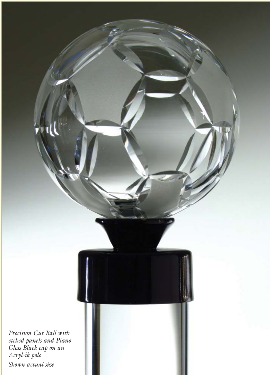
Precision Cut Ball with etched panels and Piano Gloss Black cap on an Acryl-ik pole Shown actual size