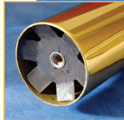
Detail shot showing how neatly the star insert fits into the end of the tube