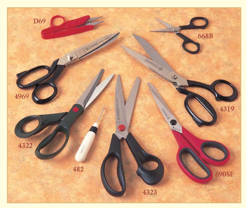
4323 240mm (9½") DRESSMAKER SCISSORS Stock Unit EACH

Black plastic contoured high comfort handle